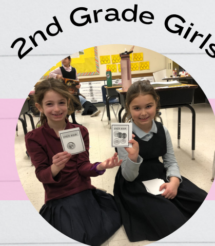
2nd Grade Girls