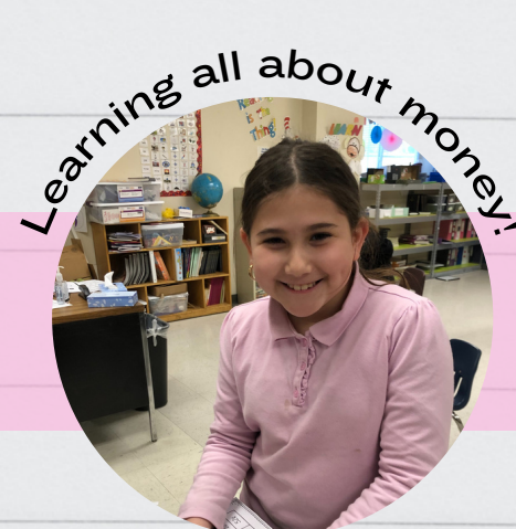
Learning all about money!