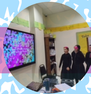
6th Grade Girls sunglass advertisement presentations using vocabulary words!