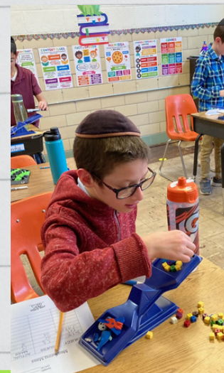
4th Grade Boys weighing slime in Science class!