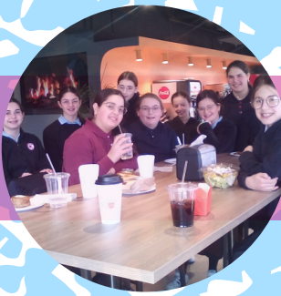
7th Grade Girls Siyum at the Orange Spot for finishing Parshas Korach!