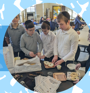
Middle school winter vacation Masmidim enjoying a special breakfast!