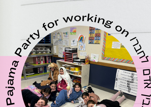
Pajama Party for working on ל !